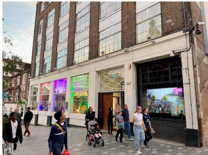
Figure 2 - The Hat Factory Arts Centre