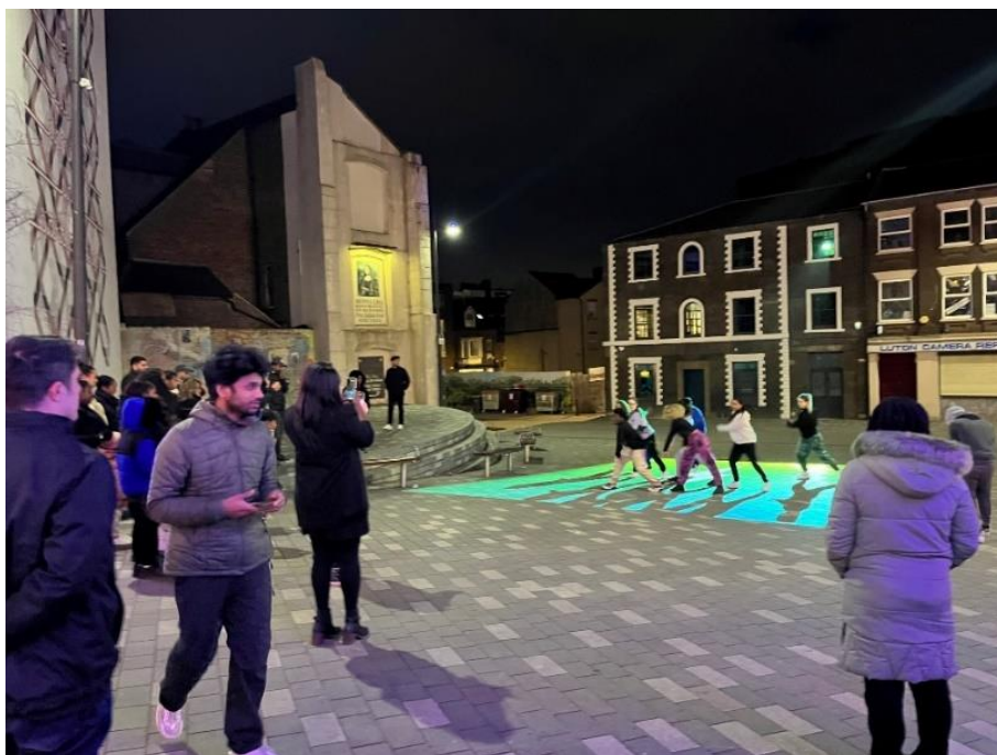
Figure 3 Example of previous work in area - The Culture Trust