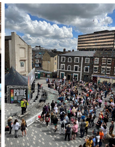
Three images of the Hat District animated